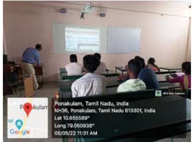
Snapshot from IV-EEE - GIMP on 05.05.2022